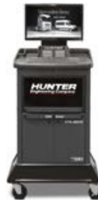
Compact mobile console shown with LCD monitor and keyboard