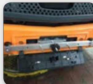
Frame reference support bar 208-34-1