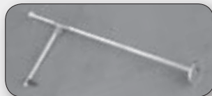
Frame offset measurement tool 221-646-1