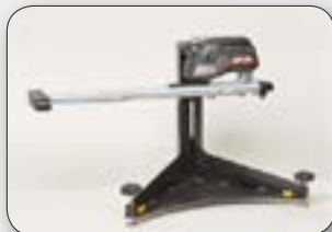
Bus body reference stands 20-3246-1 Includes 4 stands